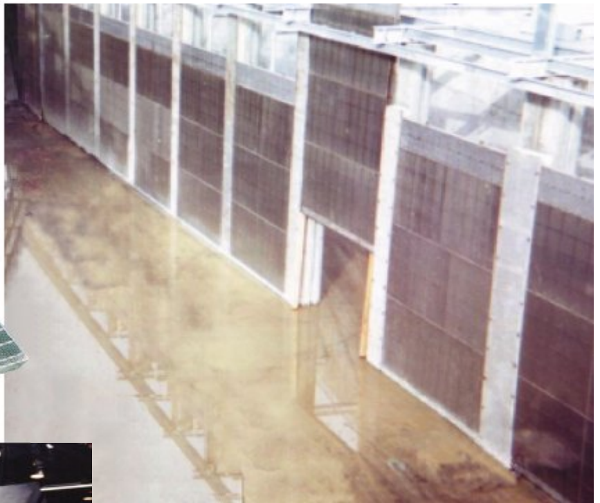
Intake System Installation