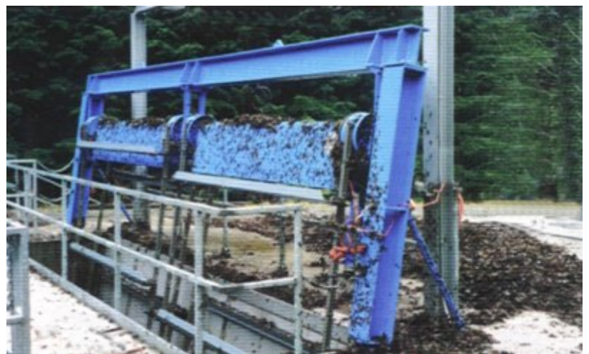
Screen Cleaning System