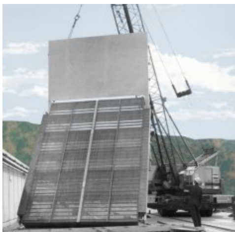
Hendrick Fish Diversion Screen installation at the Priest Rapids dam on the Columbia River